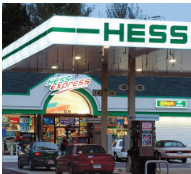
HESS EXPRESS RETAIL FACILITY IN MASSACHUSETTS

The HOVENSA refinery in the United States Virgin Islands is jointly owned by the Corporation and Petroleos de Venezuela S.A. (PDVSA) and is one of the largest refineries in the world. The facility is strategically positioned and enjoys significant economies of scale.