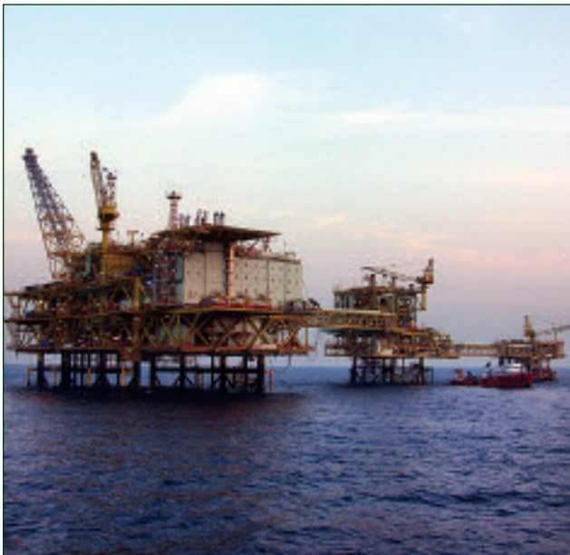
JOINT DEVELOPMENT AREA, MALAYSIA/THAILAND

The fabrication of the Ujung Pangkah (AHC 75%) gas platform and onshore processing facility began in 2005. The project is on schedule to commence natural gas production by early 2007 at a rate of about