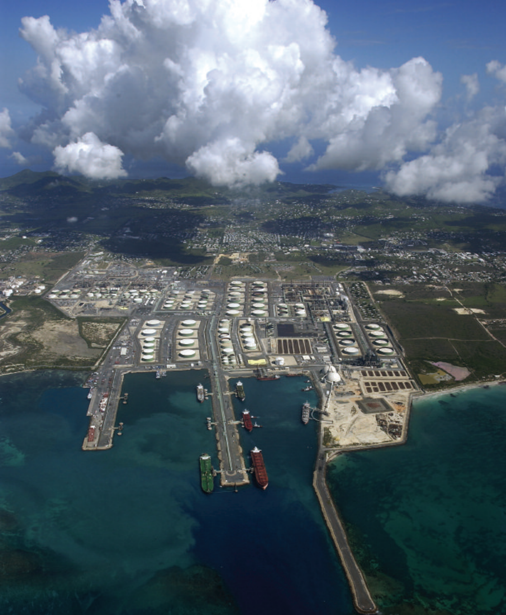
REFINERY IN ST. CROIX, U.S. VIRGIN ISLANDS