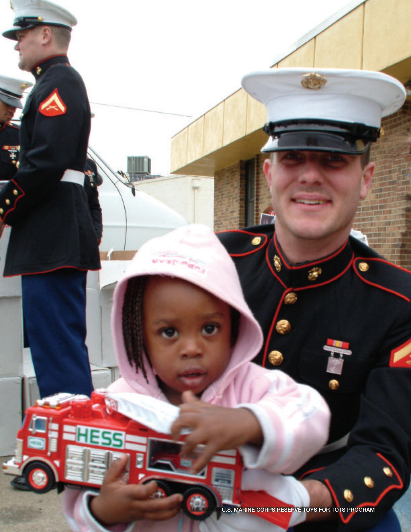
U.S. MARINE CORPS RESERVE TOYS FOR TOTS PROGRAM