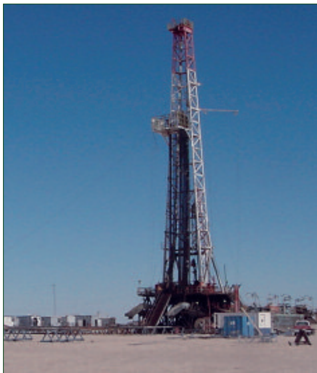
OPERATIONS IN LIBYA

In 2005, we acquired a controlling interest in the Samara-Nafta joint venture in the Volga-Urals region of Russia and added additional assets and licenses to the venture during the year. As of the end of the year, we had invested about $400 million in Russia and had