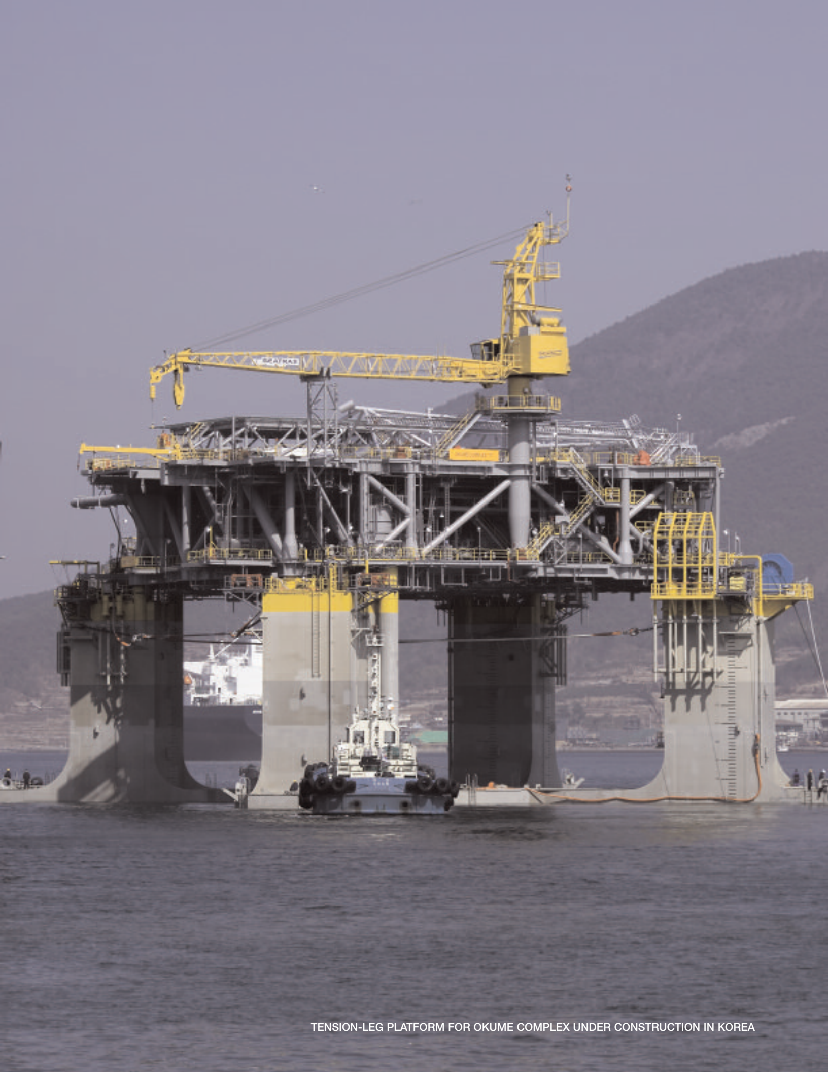
TENSION-LEG PLATFORM FOR OKUME COMPLEX UNDER CONSTRUCTION IN KOREA